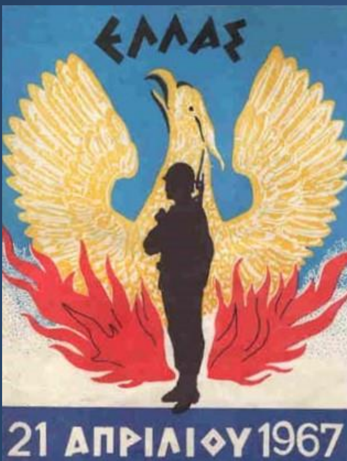
Symbol of dictatorship

In July 1965, there was a conflict in the ranks of the ruling Union Center party, as the Prime Minister G.Papandreou was forced to resign. From that time until December 1966, King Konstantinos II attempted to form a series of governments with far-right Union Center members. In 1967, in a situation of political instability , elections for May are called. Right-wingers and the king are afraid of a progressive government . On 21 st April 1967, a group of army officers led by Colonel George Papadopoulos, abused power on the grounds, that the country was in danger from the Communists and led the country in Dictatorship.