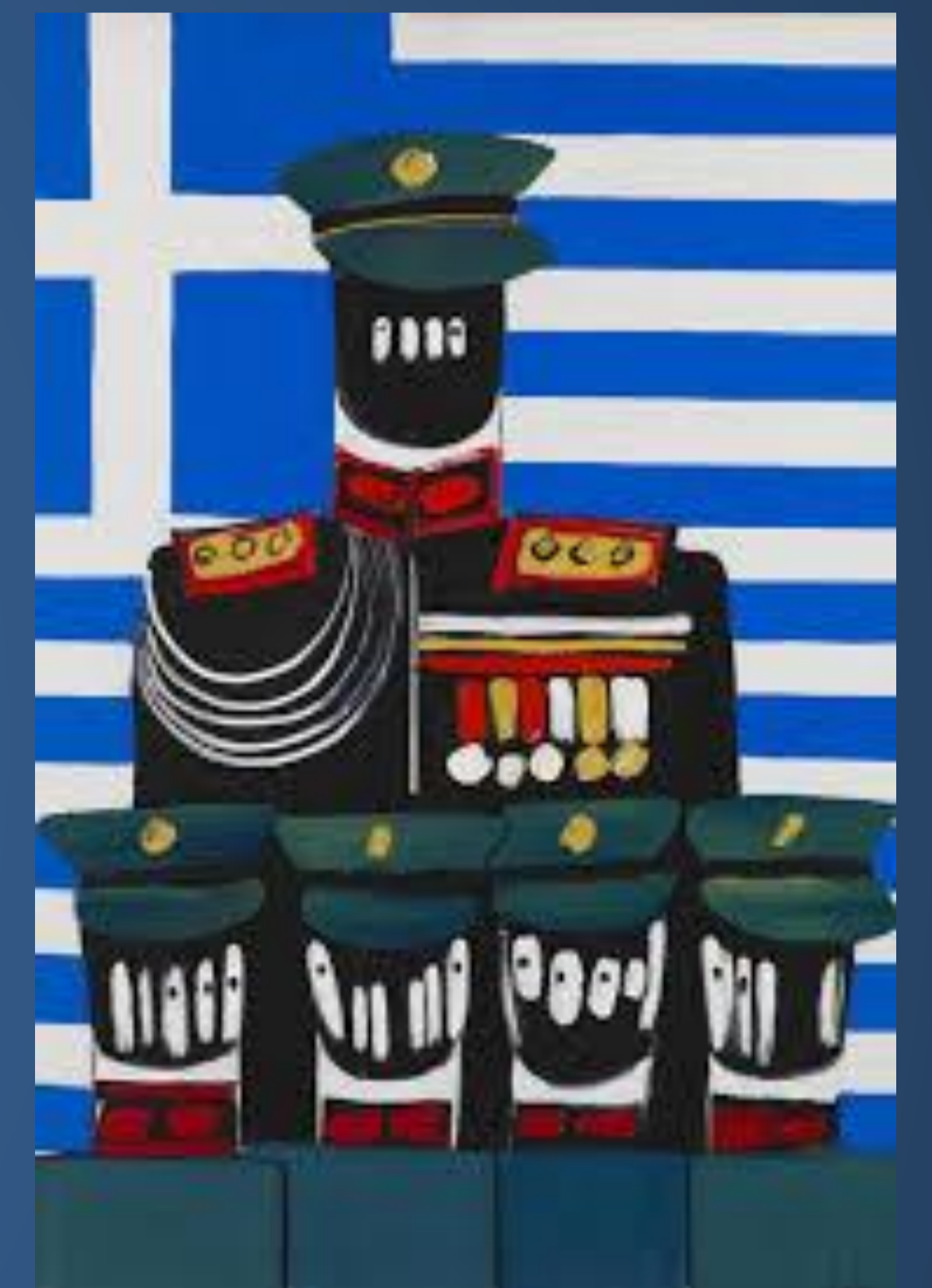
G.Gaitis "The General" (1967)