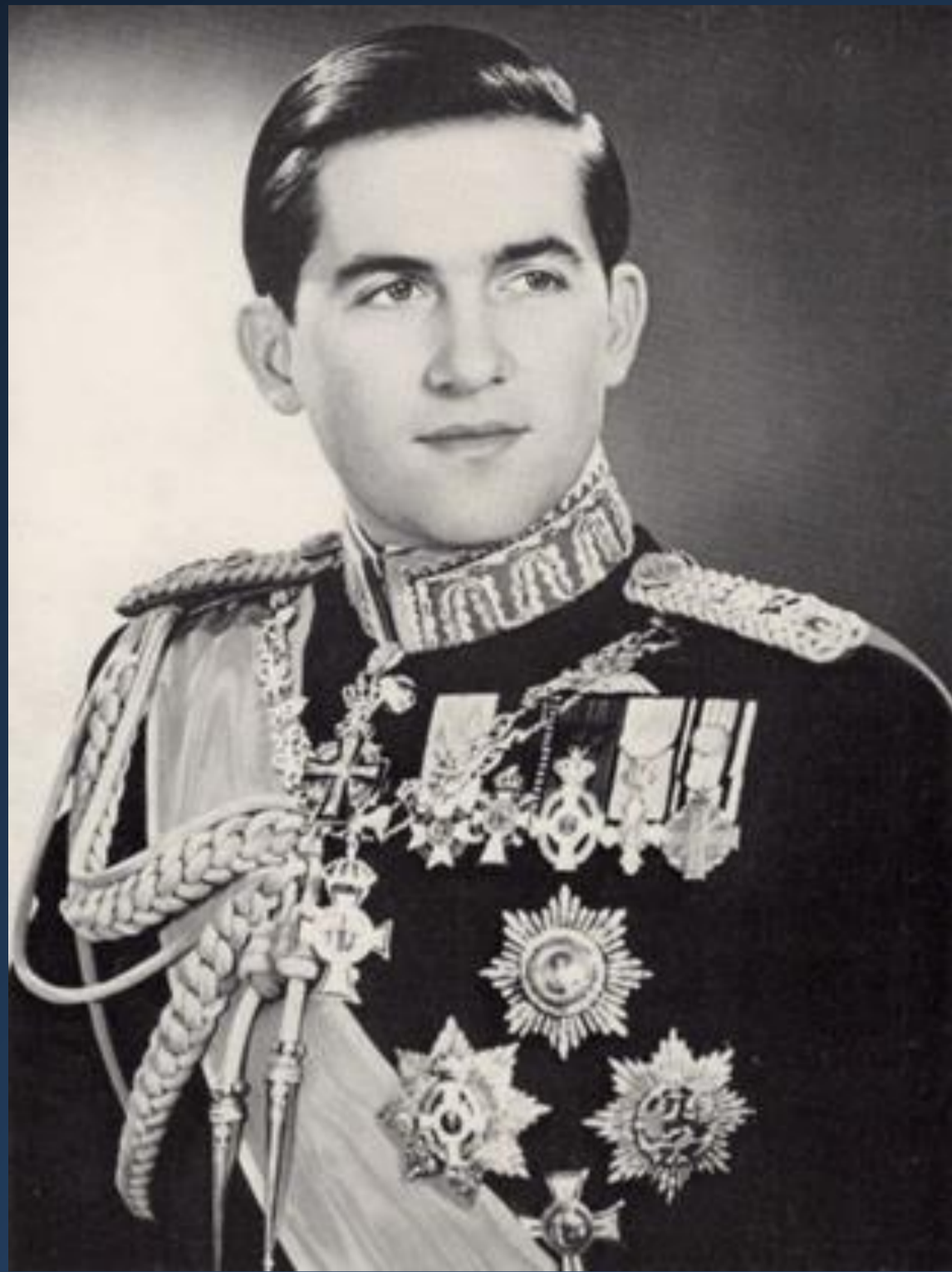
King Konstantinos II