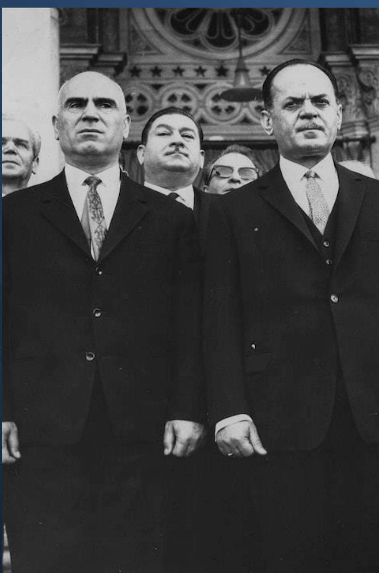
Dictators G.Papadopoulos and St. Pattakos